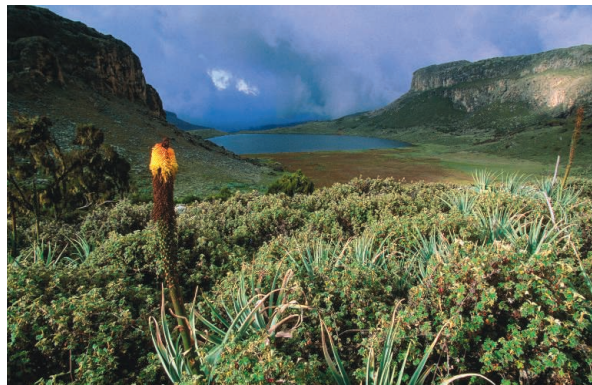
The Bale Mountains National Park in the Ethiopian highlands is home more than half of the world's estimated 366 Ethiopian wolves, Canis simensis (10) seen at right.

S2). Nearly all are located in biogeographic regions of exceptional levels of endemism (12) and nearly all have already been identified as key biodiversity areas (13). Collectively, they are responsible for the long-term conservation prospects of 627 species (119 birds, 385 amphibians, and 123 mammals), including 304 globally threatened species (60 birds, 179 amphibians, and 65 mammals) whose global distributions fall mostly (>50%) within these sites. For 88 of these PAs, the conservation stakes are particularly high, as they overlap sites previously iden-