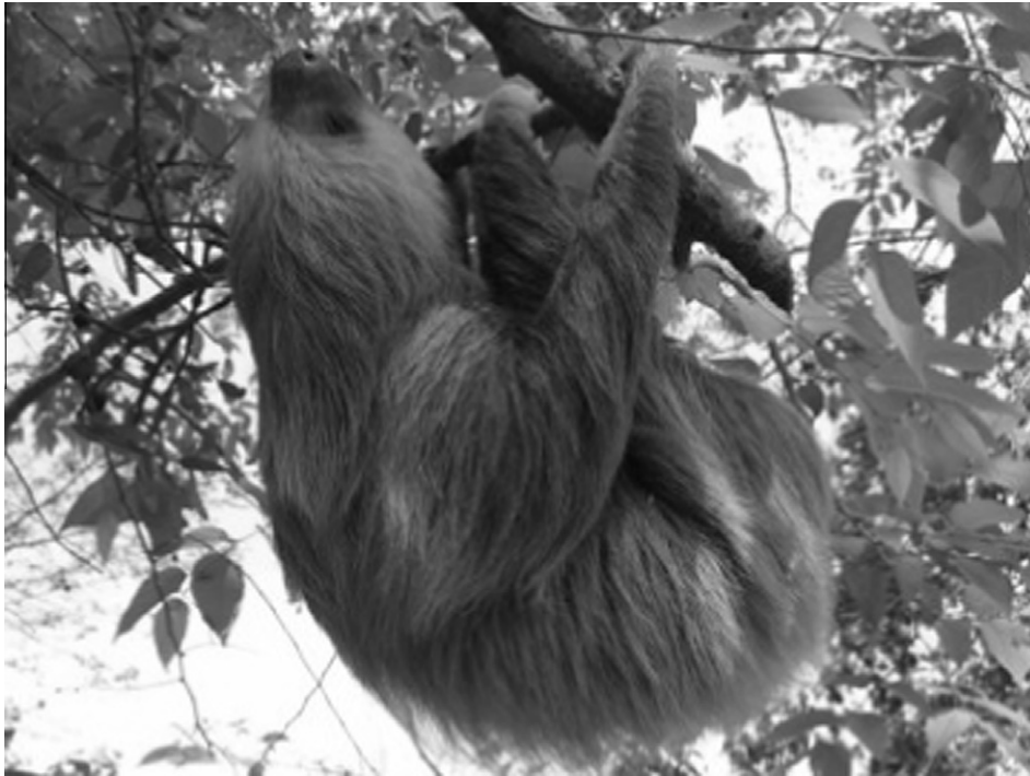
Fig. 3. Two toed sloth ( Choloepus didactylus ) using a live fence to move across the landscape. Linear elements such as live fences and riparian forests can be managed to increase their value for connectivity.

schemes continue to be rapidly developed, often with little grounding in the ecological mechanisms that drive these services.