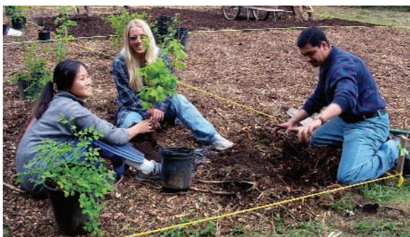
Retrieving degraded land. UW-REN capstone students restoring streamside habitat.

The restoration ecology capstone lasts for one academic year (fig. S1) and is directed by diverse faculty (9). Students, ideally representing a range of scientific and humanities fields, team up for aquatic and terrestrial restoration projects in neighboring communities. Participation is limited to senior students, who